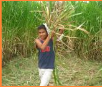
Gathering Cane for Cows