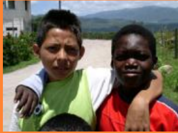
Friendship = Brotherly love!!!

Touching the Life of a Child.....Changing the Heart of a Nation. But Jesus beheld them, and said unto them, With men this is impossible; but with God all things are possible. Matt. 19:26