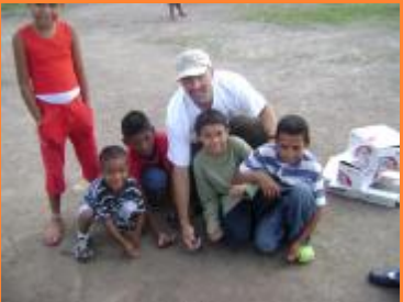
Marble Buddies are the best!!!