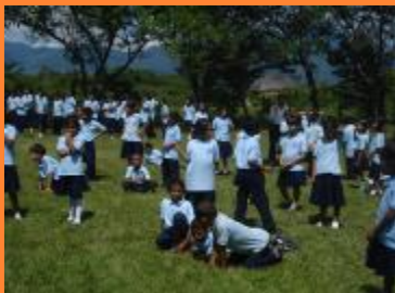
Students enjoying PE class