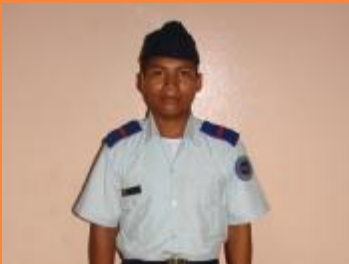
Protecting the children and people of Honduras through Air Force Academy training.