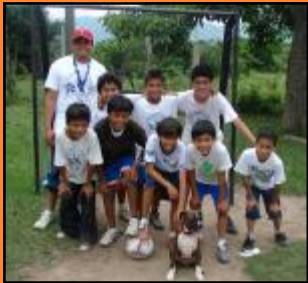
Kids are winners!!